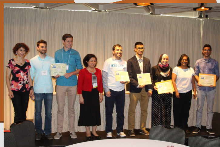
IHTC 2015 Student Design Contest

Design projects seeking to solve Humanitarian issues using Technology done from July '15 to June '17 are welcomed. Judging to be based on innovation, feasibility, relevance to real-world problems and cost-effectiveness.